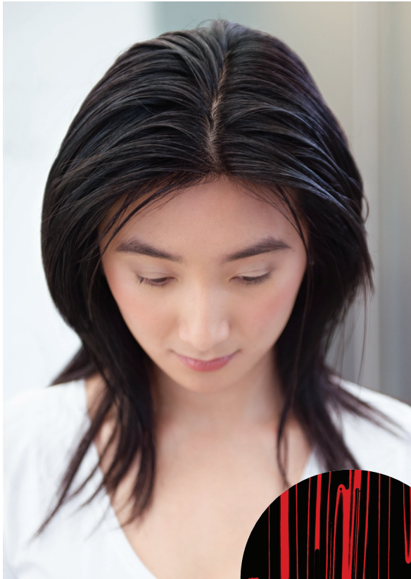
BEFORE: DIRTY HAIR