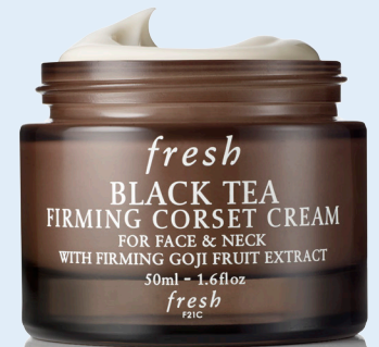
BLACK TEA FIRMING CORSET CREAM