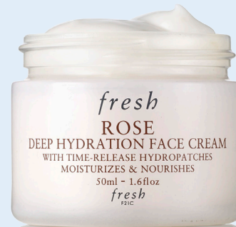
ROSE DEEP HYDRATION FACE CREAM

A tall glass of water to sip throughout the day