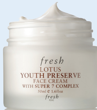
LOTUS YOUTH PRESERVE FACE CREAM