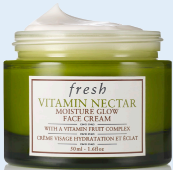
VITAMIN NECTAR MOISTURE GLOW FACE CREAM