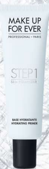
STEP 1 Skin Equalizer