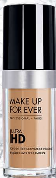
Ultra HD Foundation