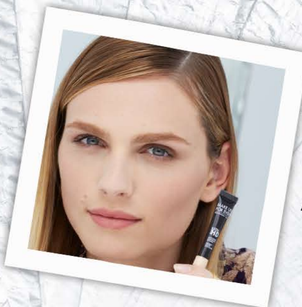
ANDREJA PEJIC, Transwoman and Supermodel