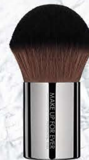
Artisan Brush 124