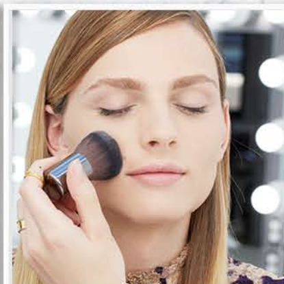
STEP 4 Finish with HD Microfinish Powder using a Kabuki Brush