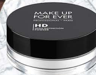
HD Microfinish Powder