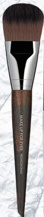
Artisan Brush 108