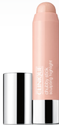
Chubby Stick Sculpting Highlight