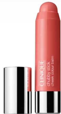
Chubby Stick Cheek Colour Balm