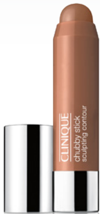
Chubby Stick Sculpting Contour