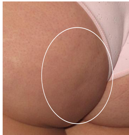
after 4 weeks