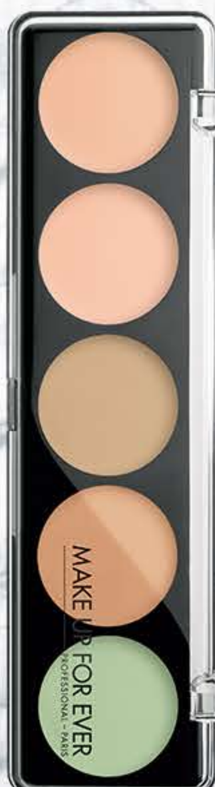
Camouflage Cream Palette 1