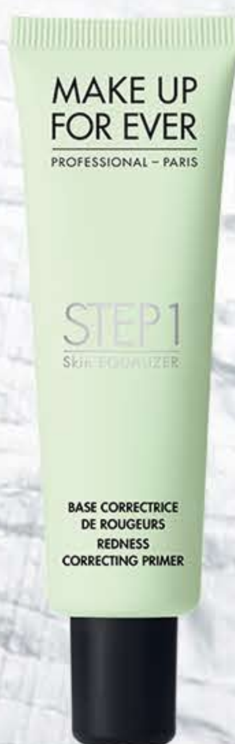
STEP1 Skin EQUALIZER Redness Correcting Primer

For mild redness , use STEP1 Skin EQUALIZER in Yellow.