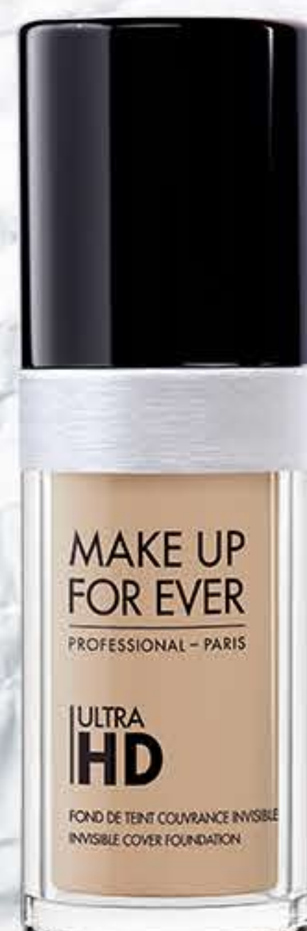
Ultra HD Foundation Y225