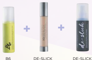
B6 DE-SLICK DE-SLICK

Keep oil and shine in check and make pores seem to vanish.