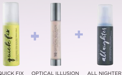
QUICK FIX OPTICAL ILLUSION ALL NIGHTER

Hydrate your skin and get a beautifully perfected look that lasts all night.