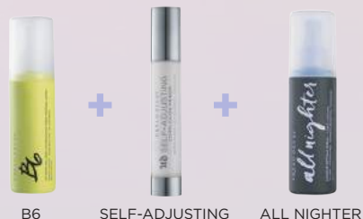
B6 SELF-ADJUSTING ALL NIGHTER

Control shine, even out your skin tone and create a soft-focus effect that lasts.