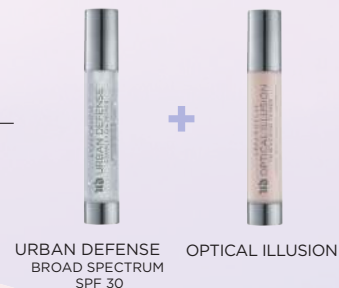
URBAN DEFENSE BROAD SPECTRUM SPF 30 OPTICAL ILLUSION

Prevent environmental damage and get a completely blurred-out effect.