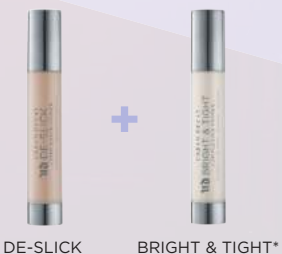
DE-SLICK BRIGHT & TIGHT*

Combination skin? Keep an oily T-zone in check while brightening and minimizing fine lines.