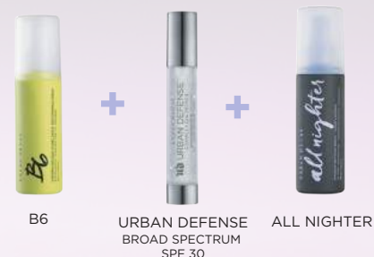
B6 URBAN DEFENSE BROAD SPECTRUM SPF 30 ALL NIGHTER

Guard your skin against whatever the day throws at you and make your look last.