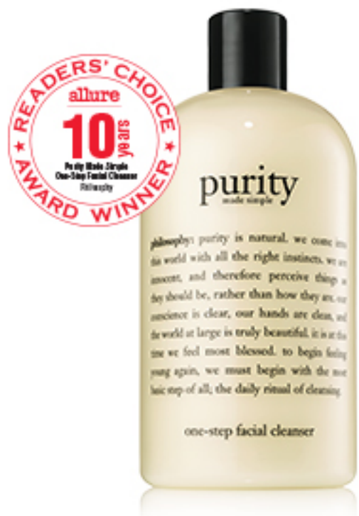
philosophy made simple one-step facial cleanser

award-winning formula melts away dirt, oil and makeup in one step!