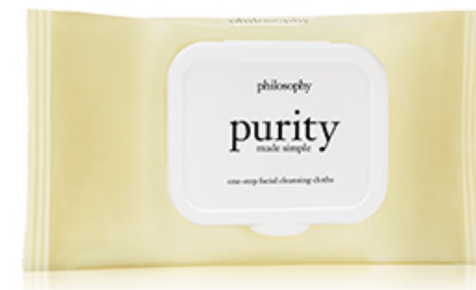
philosophy made simple one-step facial cleansing cloths