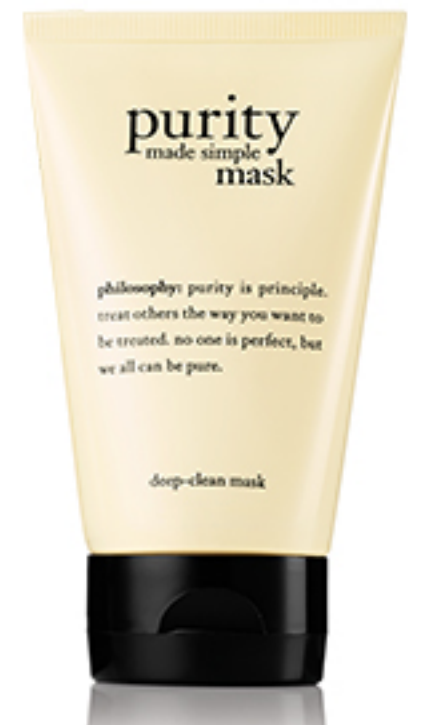
philosophy made simple deep-clean mask