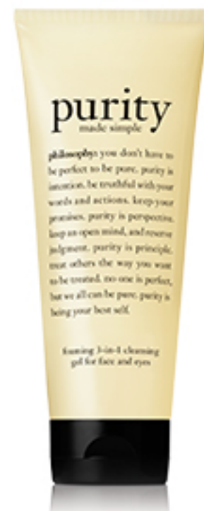
philosophy made simple foaming 3-in-1 cleansing gel for face and eyes